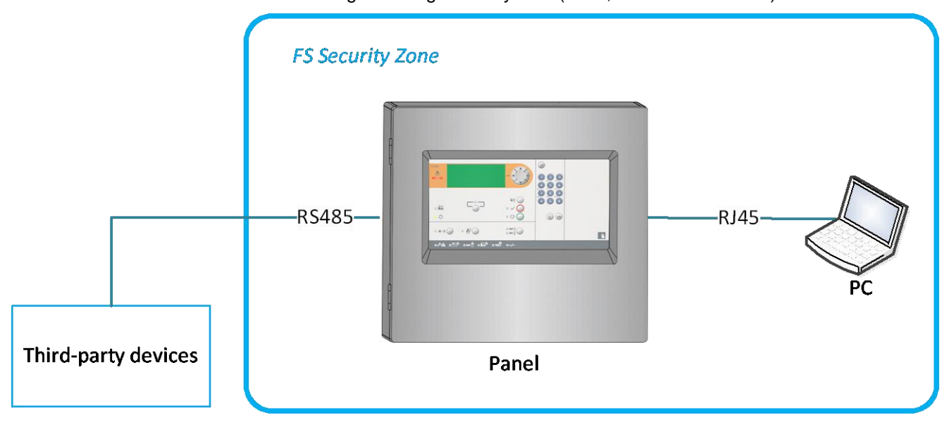
Fig. 2: Overall view, networked