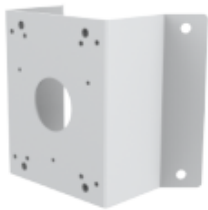
A35 CORNER MOUNT