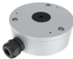
TC-P54BM SPEC: V5 JUNCTION BOX